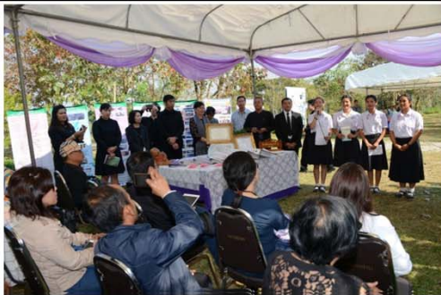
Site Visit Route 2 at Wetland Ecosystem Learning Centre