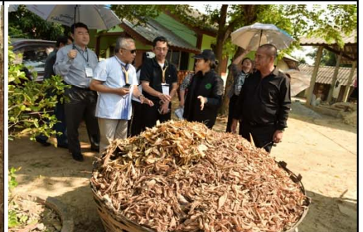
Site Visit Route 3 at Zero Waste Community