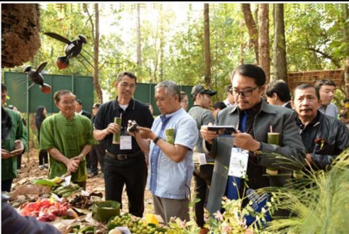
Site Visit Route 3 at Forestry community, Chiang Kiean Municipality