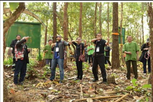
Site Visit Route 3 at Forestry community, Chiang Kiean Municipality