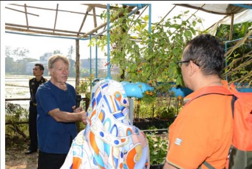
Site Visit Route 2 at Food Security for Supporting Climate Change and Disaster Management Learning Centre