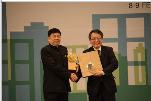
Gift exchanging between General Surasak Karnjanarat, Minister, Ministry of Natural Resources and Environment, Thailand and Mr. Shigemoto Kajihara, Vice Minister, Ministry of the Environment, Japan