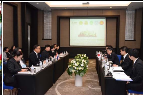
Bilateral meeting between Thailand and Japan Government