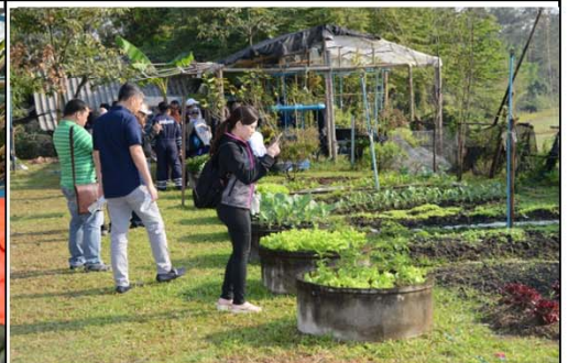
Site Visit Route 2 at Food Security for Supporting Climate Change and Disaster Management Learning Centre