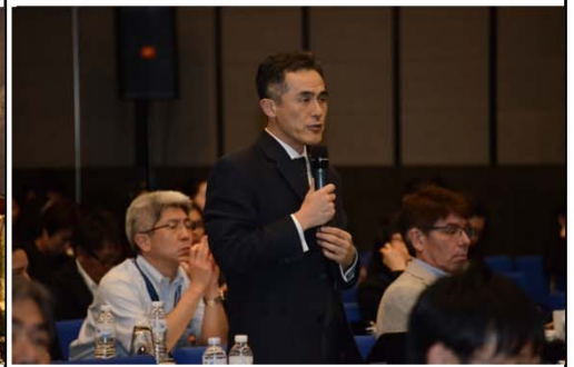
Q & A during the session