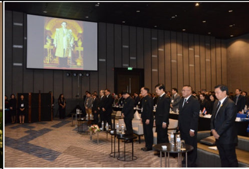
Observation of silence to pay tribute to the memory of His Majesty King Bhumibol Adulyadej of Thailand