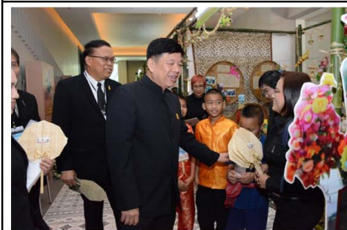
General Surasak Karnjanarat, Minister, Ministry of Natural Resources and Environment, Thailand visited the exhibition booth.